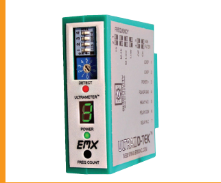
ULTRA II D-TEK (Vehicle Loop Detector)