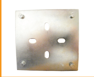
130-10020316 (Mother Board Mounting Plate)