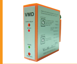
VMD (Vehicle Motion Detector)